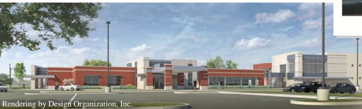
Rendering by Design Organization, Inc.