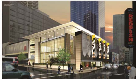
MUSEUM OF BROADCAST COMMUNICATIONS ARCHITECTS PEPPER CONSTRUCTION ECKENHOFF SAUNDERS ARCHITECTS

Renovating this 70,000 sq ft parking structure into a museum was a unique challenge for RLMA and our client, Eckenhoff Saunders Architects. With a LEED Gold rating goal, this facility will house exhibits, the Radio Hall of Fame, a multimedia café, administrative offices, and multi-purpose screening space.