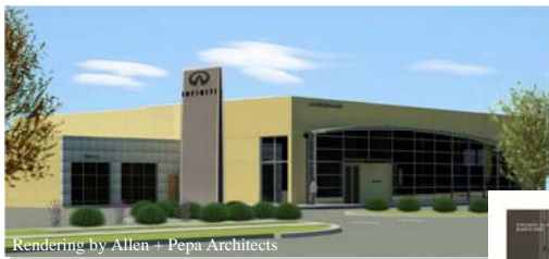
Rendering by Allen + Pepa Architects

Our latest is a 20,200 sq ft Infiniti dealership with Allen + Pepa Architects. The building will feature a sales boutique, a service lounge, and a twenty bay service department.